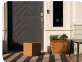
Know When People and Packages Arrive