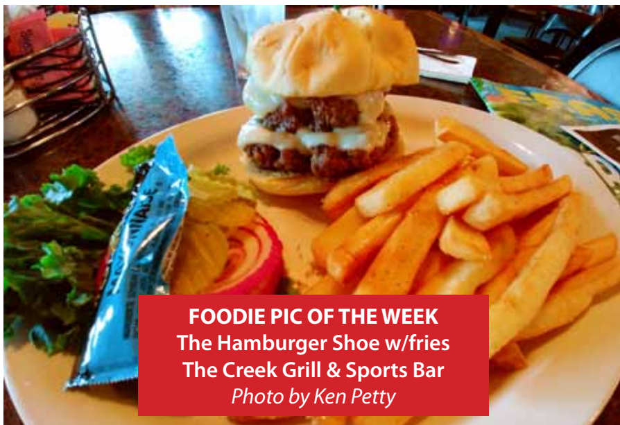
FOODIE PIC OF THE WEEK The Hamburger Shoe w/fries The Creek Grill & Sports Bar

Ultimately, the best St. Louis-style pizza is a matter of personal preference. Each restaurant has its unique take on the style, from the crust to the cheese to the toppings. St. Louis residents and visitors alike should try each of these spots to determine their favorite. Whether you prefer the classic taste of Imo's or the unique toppings at The Black Thorn or Pi Pizzeria, there's no shortage of delicious options in this Midwestern city.