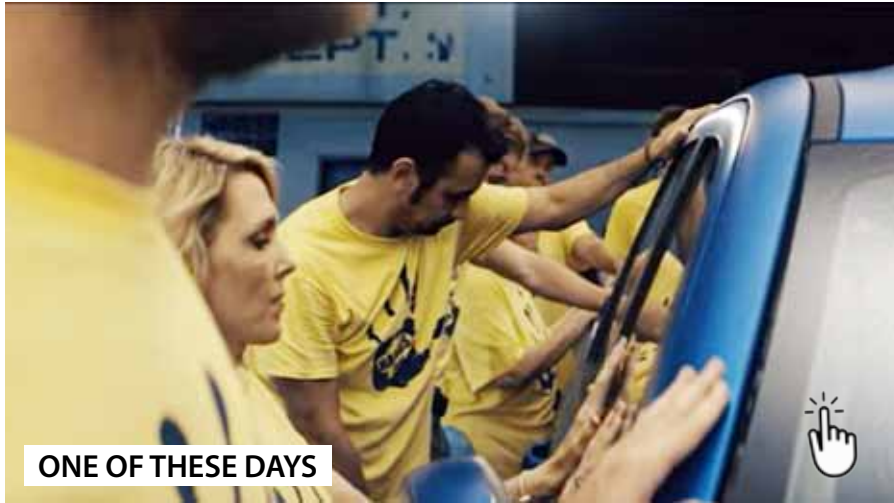
ONE OF THESE DAYS