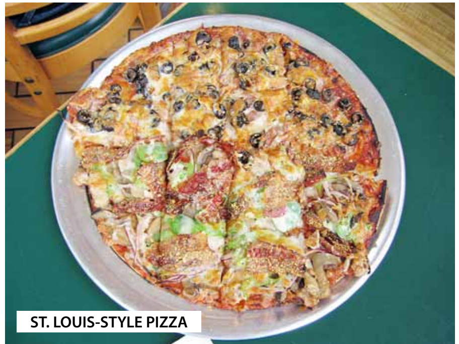
ST. LOUIS-STYLE PIZZA

Years of experimentation has led to a familiarity that allows each musician to open spaces in their playing and fall into comfortable grooves. They easily and ef-