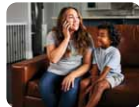
Peace of Mind Starts Here