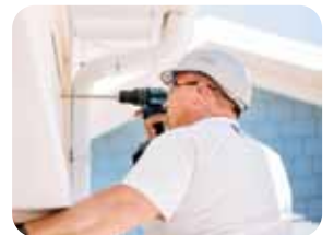
Get FREE Professional Installation and Four FREE Months of Monitoring Service*

One Connected System For Total Peace of Mind